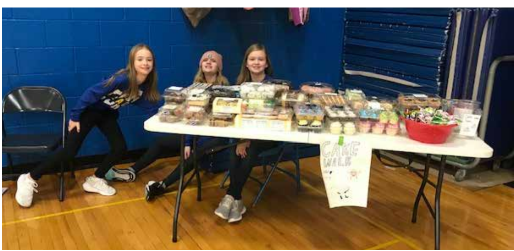
Left, The Esko Leads group had a big hand in coordinating the carnival portion of the event.

Esko Community Education, in conjunction with Esko Community Partnership put on the first Winterfest event on February 18th. The celebration included a business expo comprised of Esko based businesses, a children's carnival supporting different school groups, STEM and sensory experiences for our littlest students and concessions from Mike's Cafe and Pizzeria.