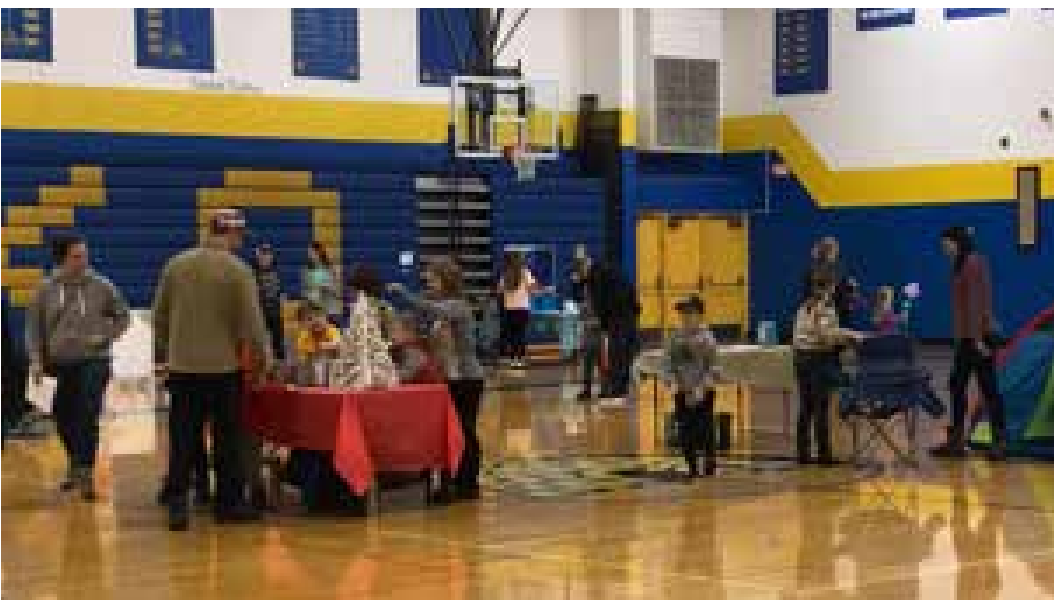
Below, Esko Cub Scouts ran a sucker pull game and an obstacle course.